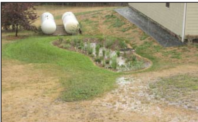
Figure 2. A new rain garden captures roof and yard runoff from a ½ inch, 15-minute prairie thunderstorm in July. Note the drought stressed yard outside the rain garden.