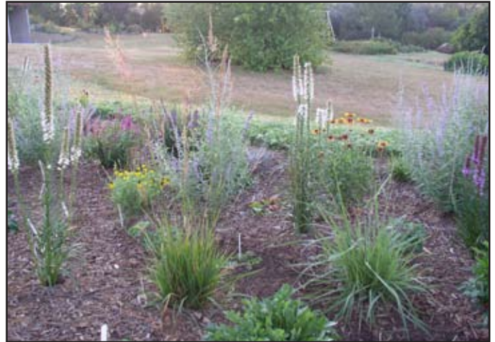
Figure 5. For much of the summer in the Great Plains, a rain garden might be the only "green" area in a non-irrigated yard.

Use potted or bare root plants rather than seeds. Plant from April to September. Place the more water tolerant species near the bottom, and drought tolerant near the edges. Plant spacing will vary depending upon species and desired appearance. Generally, 15-18 inches between plants is adequate. Consider mature size when spacing plants.