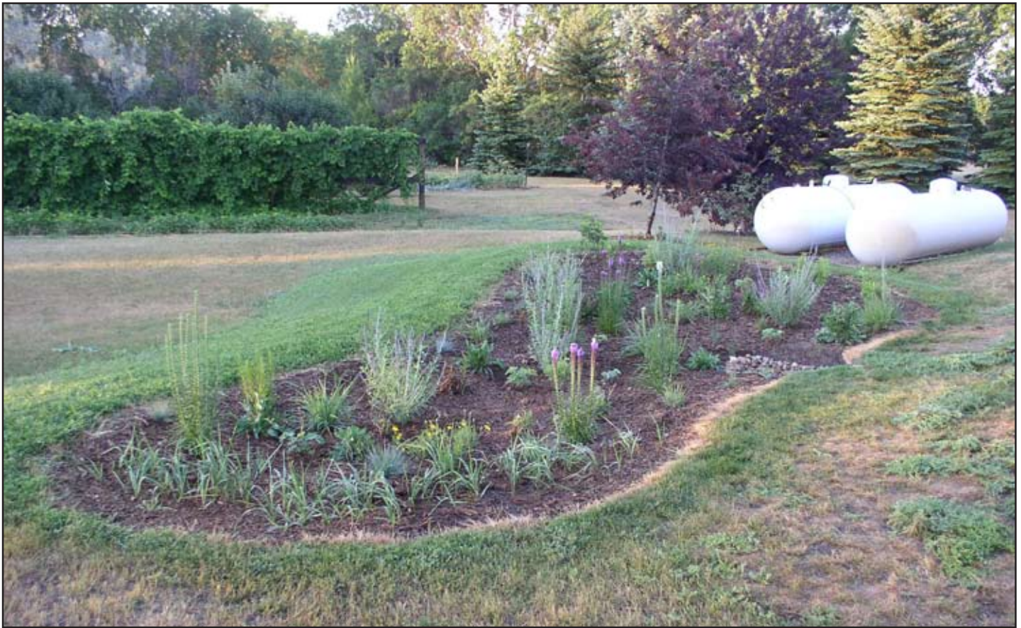
Figure 1. A 200-square foot rain garden blooms just 2 months after construction and planting.